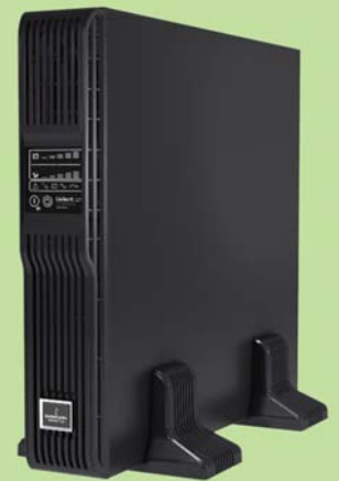
Liebert GXT3 mini-tower model provides 1000VA capacity in a compact design.