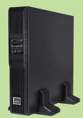
Liebert GXT3 mini-tower model provides 1000VA capacity in a compact design.